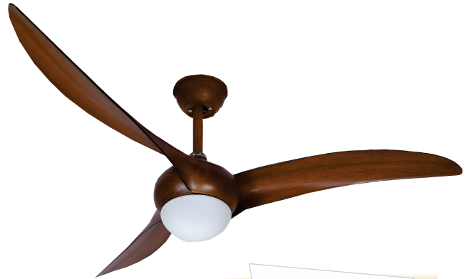
ESC - 310