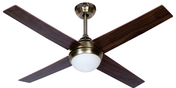
HJ - 3313