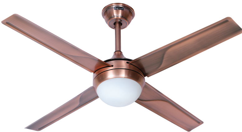
ESC - 300A