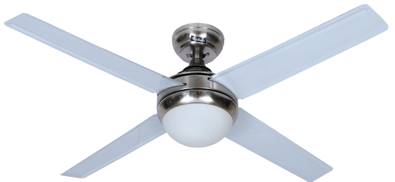
ESC - C 301