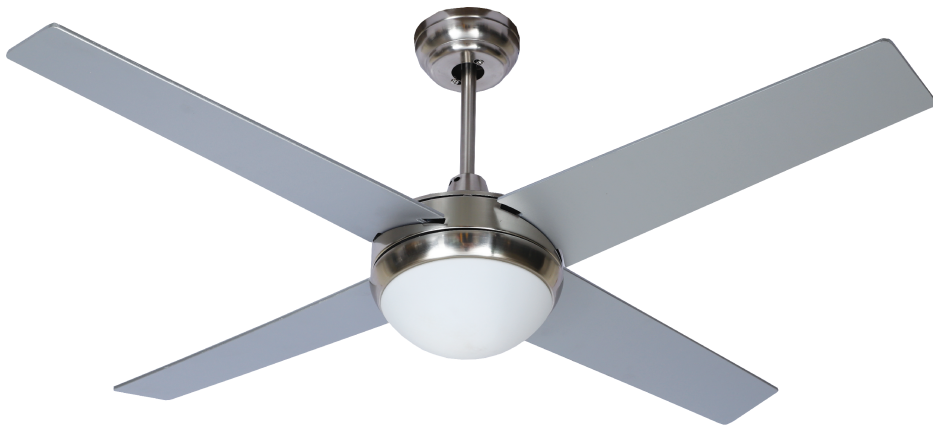
ESC - C 116