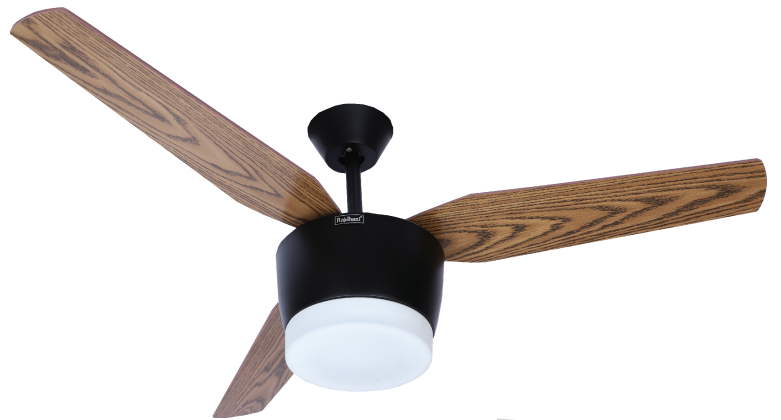
ESC - C 305