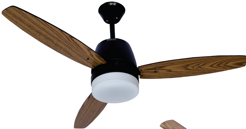
ESC - C 311