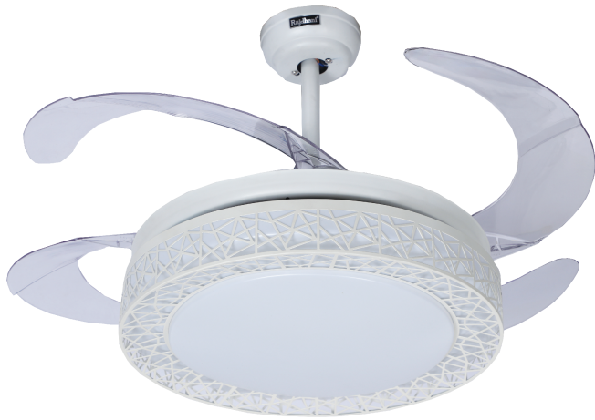
ESC - 413