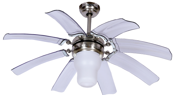
ESC - 400A